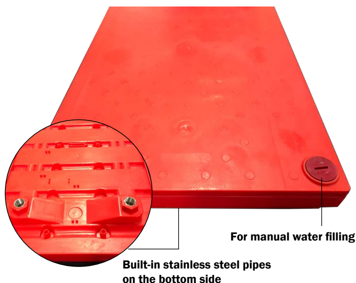
Built-in stainless steel pipes on the bottom side