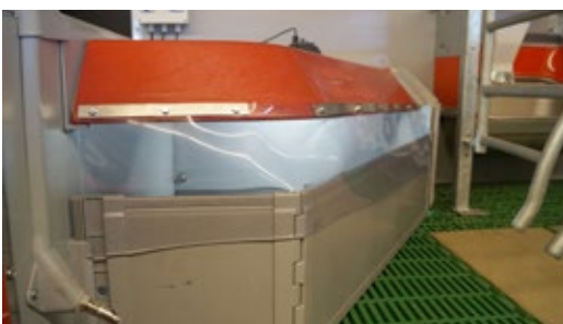
2900668 Kit for Curtain INN-O-CORNER Width 80cm 2900669 Kit for Curtain INN-O-CORNER Width 90cm

**The test was made with an electrical heating plate. The temperature was measured each minute for at least 1000 samples. The diagram shows how the curtain improves the final temperature. The temperature data logger was placed in the same position, i.e. 100 mm from the floor and in the middle of the nest.