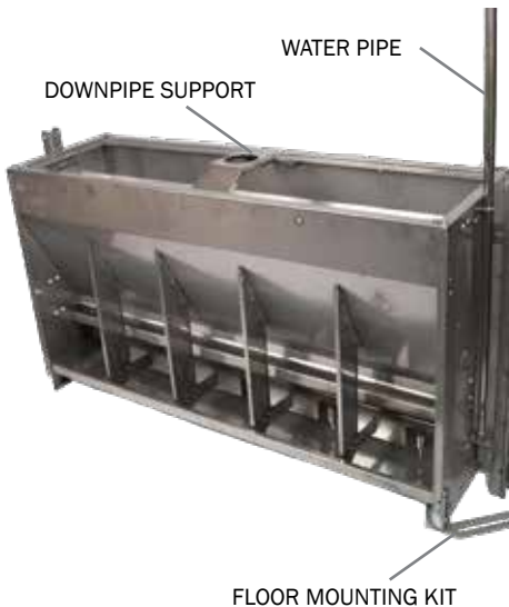
FLOOR MOUNTING KIT