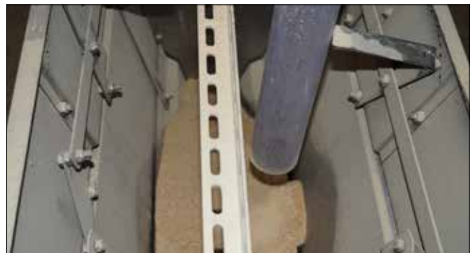
The feed comes directly from the down pipe