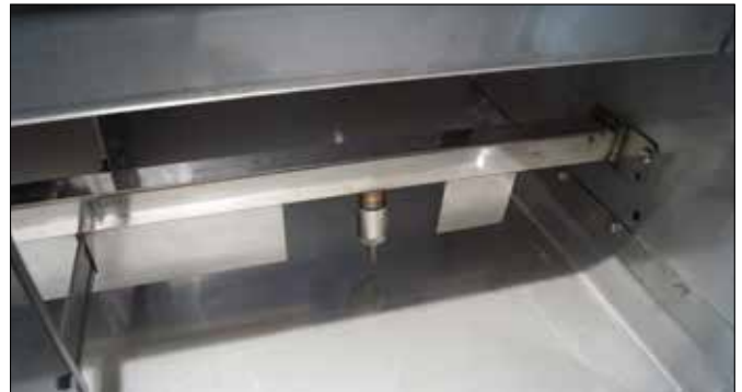
Drinking water for the pigs comes from pressure valves in the trough.