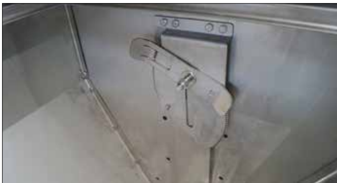
Simple and precise adjustment of feed amount.